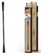
FIBREGLASS TUBE WITH NUTS 47 CM - 18.5 INCH Reference 8.26.71.873

Versatile handle adaptable to your application needs.