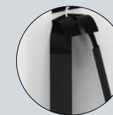
Adjustable padded straps