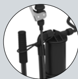
Clamp for level