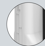
Translucent tank with level indicator