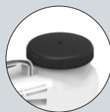
Tank lid with anti-drop