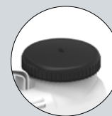
Large opening with filter for easy filling and cleaning