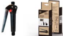
IK HANDLE (INOX) Reference 8.26.71.872

12 mm - 0.47 inch diameter hose. It is easy to manoeuvre and chemically resistant.