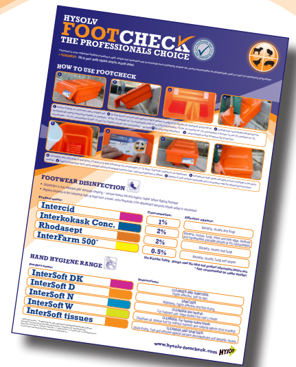
Easy-to-use wall chart